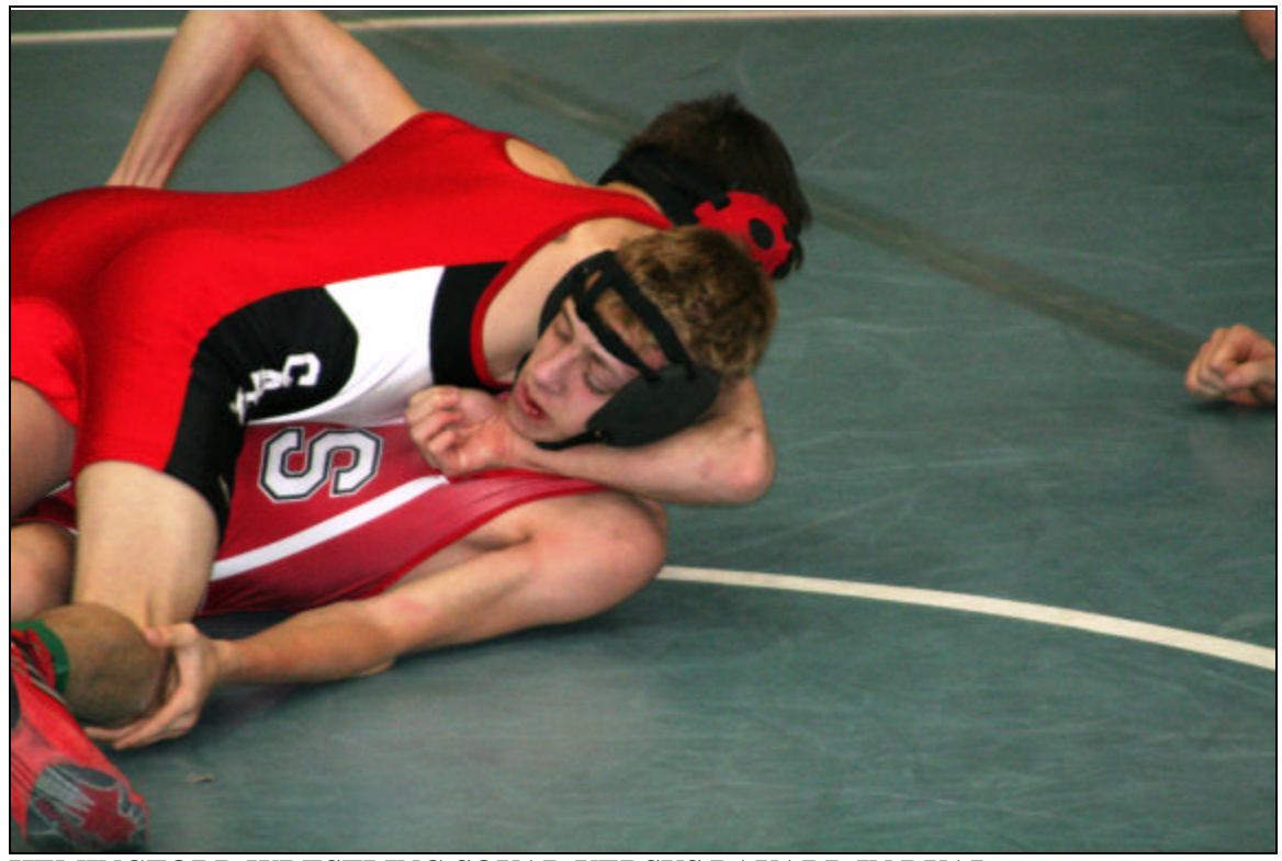
HEMINGFORD WRESTLING SQUAD VERSUS BAYARD IN DUAL 01/10/2008

On Jan, 10 2008 the Hemingford wrestling squad met the Bayard Tigers wrestling squad in a team dual at Bayard. The final score was 42 to 29 in favor of Bayard. Hemingford won three matches, lost five matches and won two matches by forfeit.