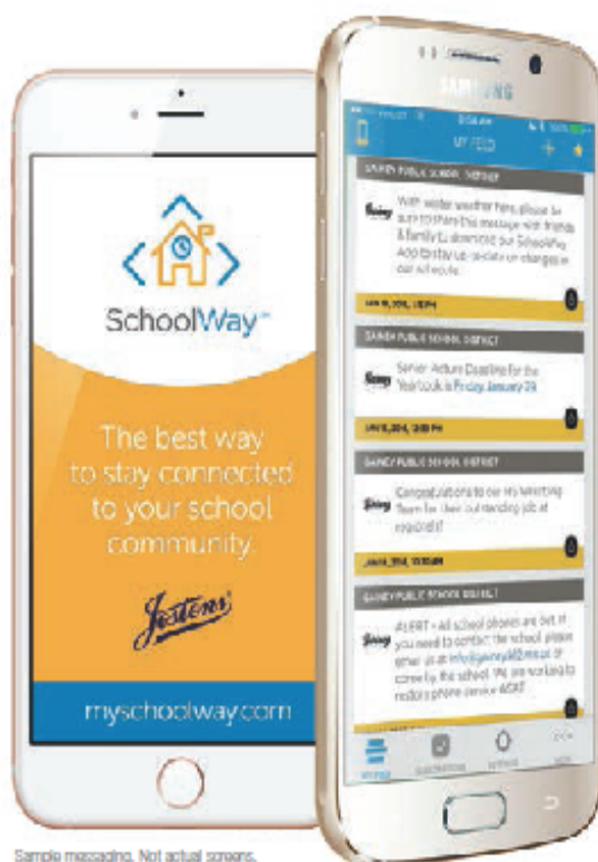
Sample messaging. Not actual screens.