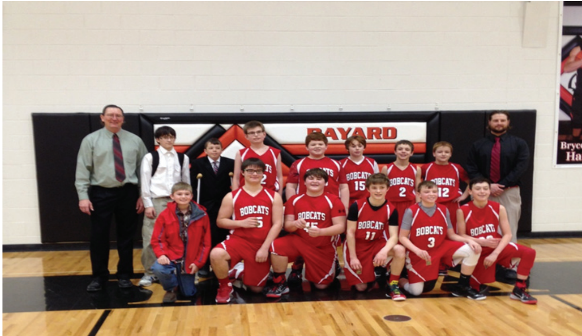
Junior High winners of the season ending Bayard Tournament.

Junior High defeated Bridgeport 34-24 and Bayard in the championship 51-26.